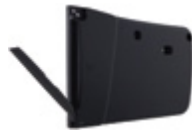
RT10-CAC - AVAILABLE IN US AND EUROPE ONLY

Replacement capacitive stylus with tether.