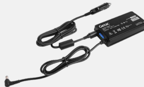
Cigarette Lighter Plug Version