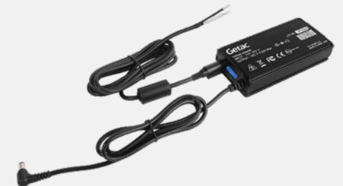
Bare Wire Version